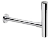
1 1/4" outlet connector for basin. 300 Pipe